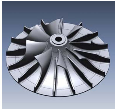
Finished impeller CAD file that is editable to make changes