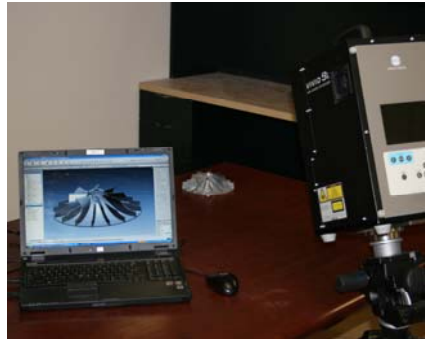
3D scanning of turbo impeller

Visit www.ems-usa.com for more information.