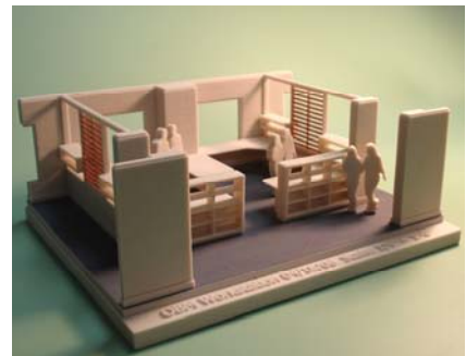
3D Office Layout