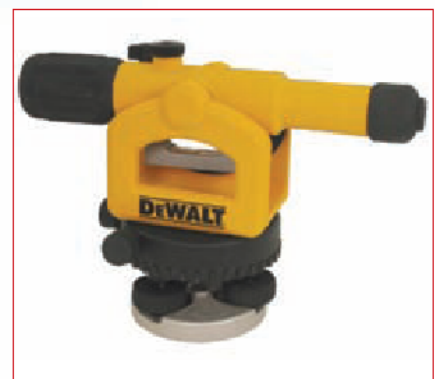
Painted Z Corp model of a DeWALT Auto Levelling Transit.

However, as Black & Decker product designers became increasingly proficient with 3D CAD tools in recent years, demand for early concept