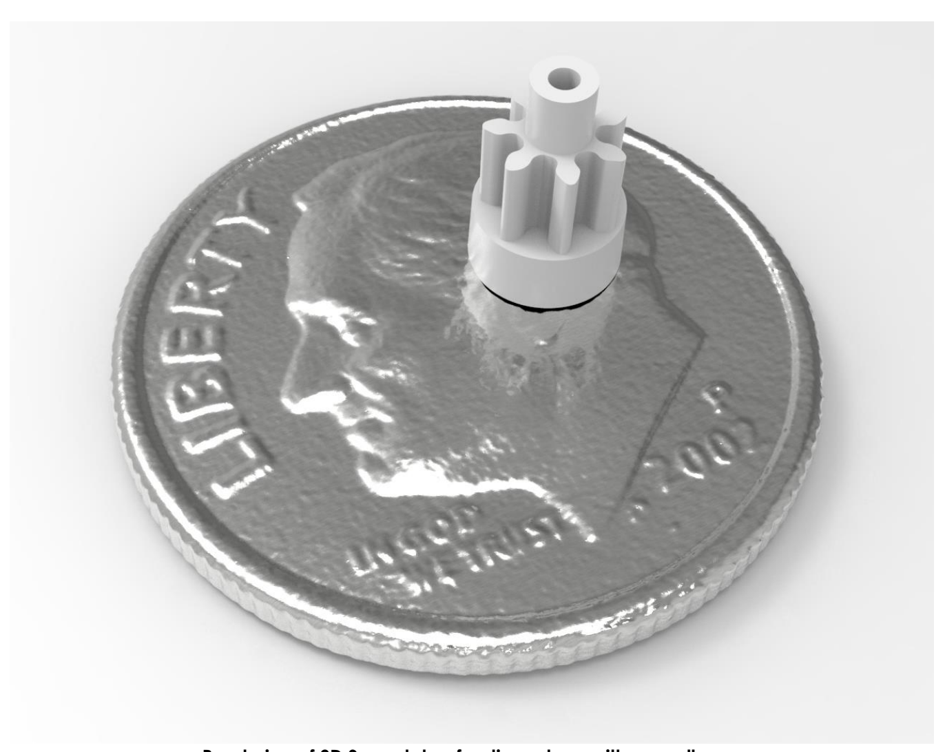
Rendering of 3D Scan data of a dime along with a small gear

Visit <u>www.ems-usa.com</u> to learn more.