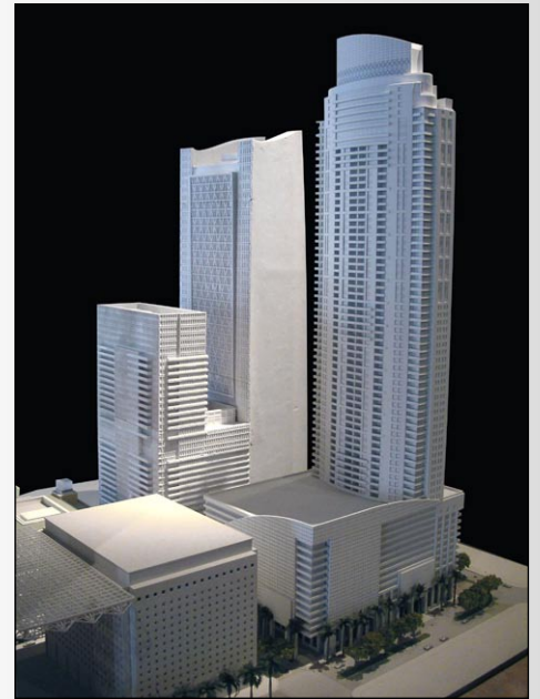
The Realization Group used the ZPrinter 310 Plus to create this 28-inch-high model of “The Met” in Miami, in one-fourth of the time and cost of traditional architectural modeling methods.

“Speed is the key. I can take an order for a model today and drop it off with the customer tomorrow. Cost is another key ... I can make that model for one-fourth the cost of stereolithography or laser-cutting.”